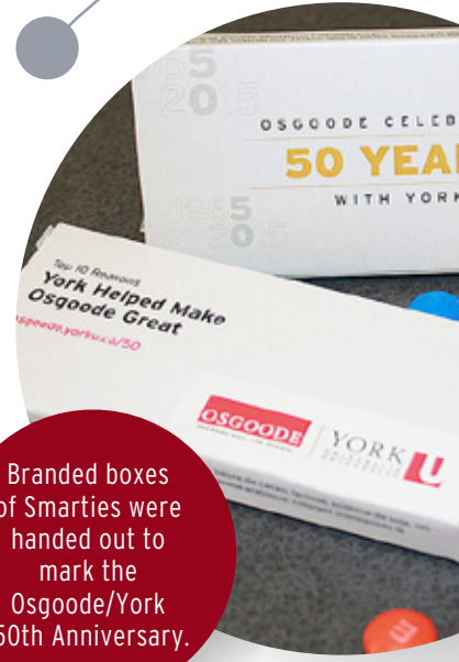
Branded boxes of Smarties were handed out to mark the Osgoode/York 50th Anniversary.