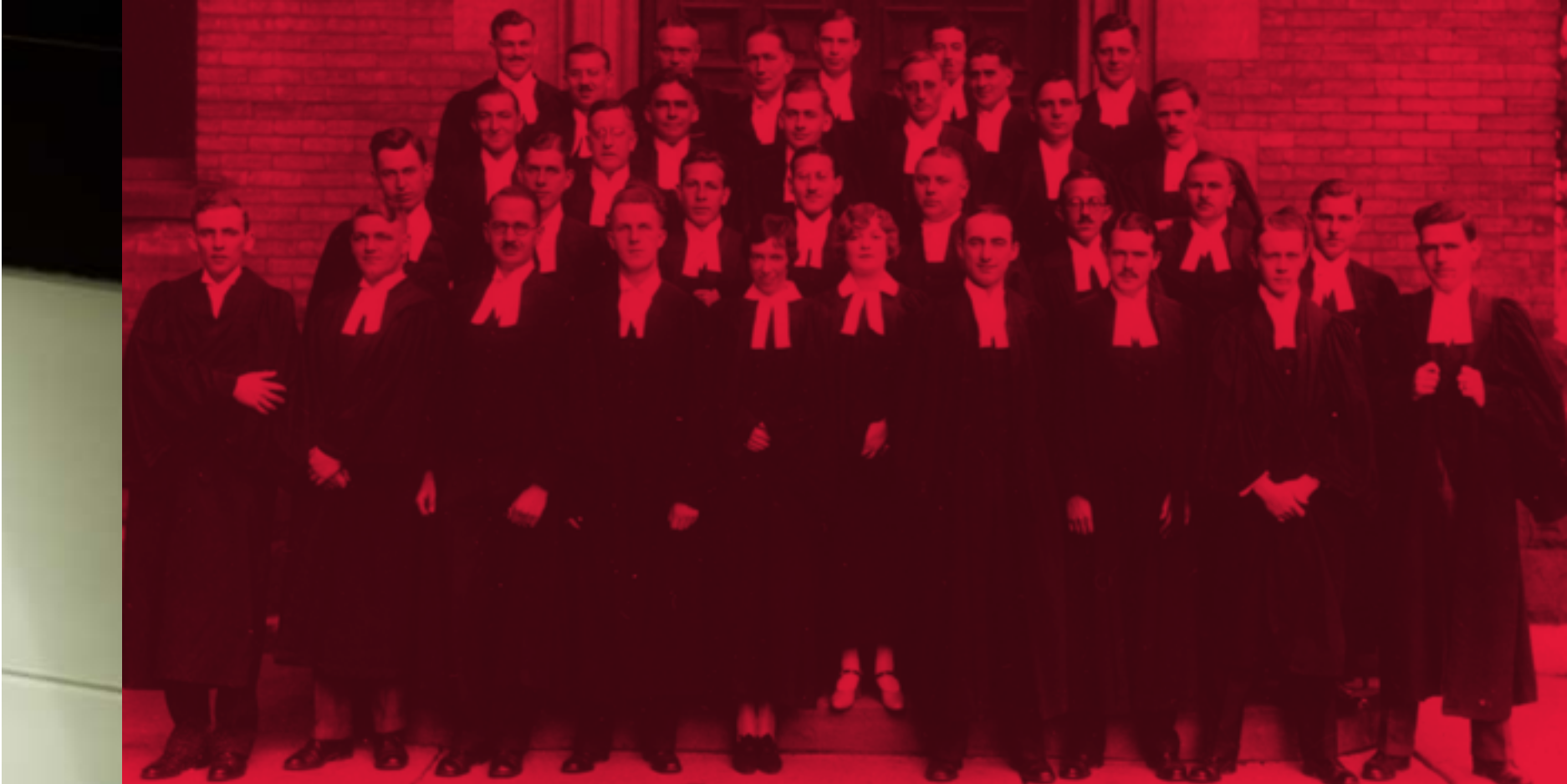
Class of 1929 Call to the Bar

We'd love to tell you more about Osgoode. To speak with current students and learn more about living and studying at Osgoode, contact recruitment@osgoode.yorku.ca . Or connect with us at one of our virtual fall admission events which are posted on our website.